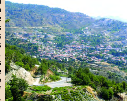
Panoramic view of the Pelendri village

It also offers an excellent view from the side of the village of Pelendri towards the villages of Ayios Ioannis and Ayios Theodoros Agrou, towards the Lemesos gulf and from the Fylagra side to the southern slopes of the Troodos Forest, especially the area of Mesa Potamos.