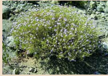
Thymus capitatus (Wild Thyme)