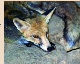
Vulpes vulpes indutus

Hare, Lepus europaeus cypricus Red Fox, Vulpes vulpes indutus Long eared Hedgehog, Hemiechinus auritus dorotheae