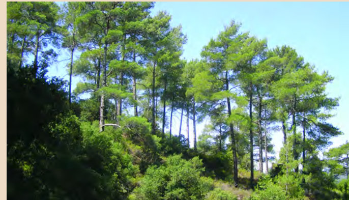
Calabrian pine stand

Vegetation around the main part of the trail is uniform and comprises natural pine forests with Calabrian Pine ( Pinus brutia ) and Rock Rose ( Cistus creticus & Cistus salviifolius ) as an understorey.